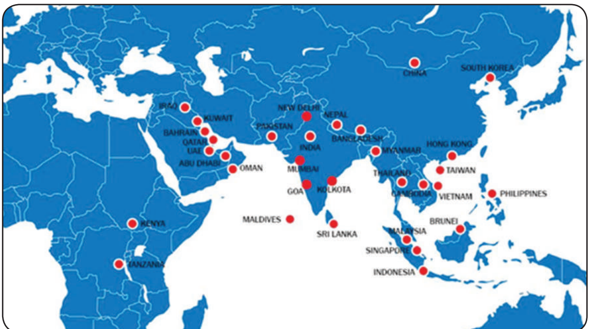
Ports covered by BLPL