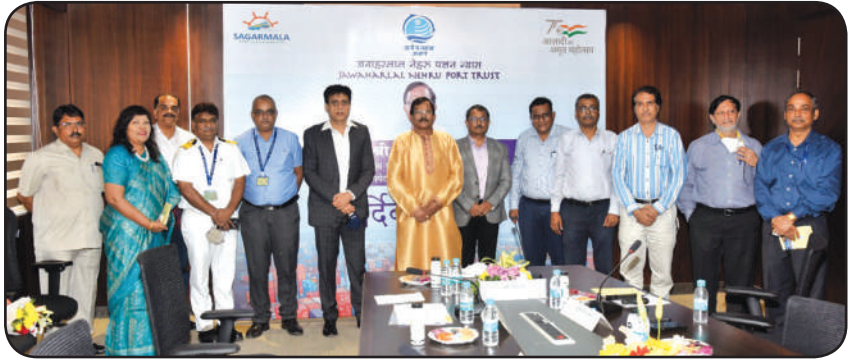
With JNPT officials